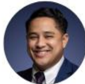
Elvin Villalobos Vice Mayor, District 3